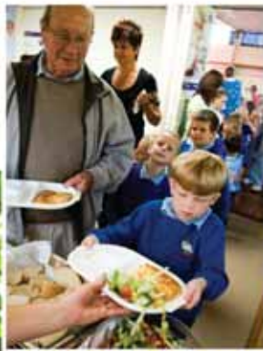
Shared reading with the Junior School